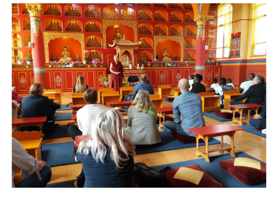
Impressions from the London Southwark Inter Faith Walk